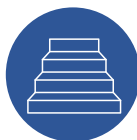
PUBLISHING & CAREER