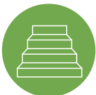
PUBLISHING & CAREER